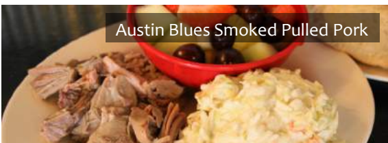
Austin Blues Smoked Pulled Pork