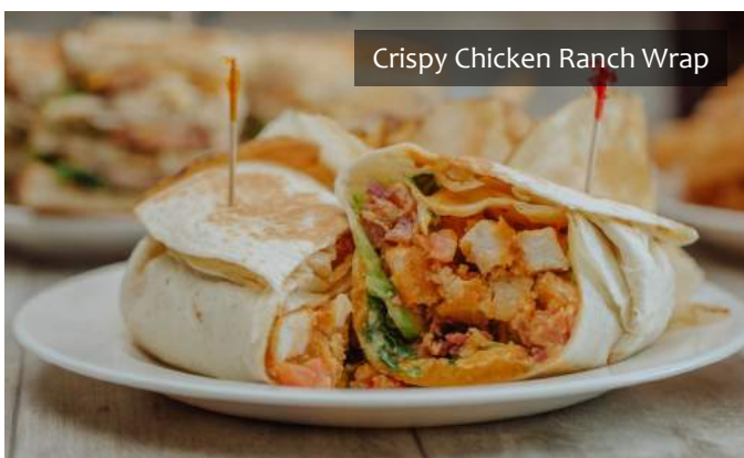
Crispy Chicken Ranch Wrap