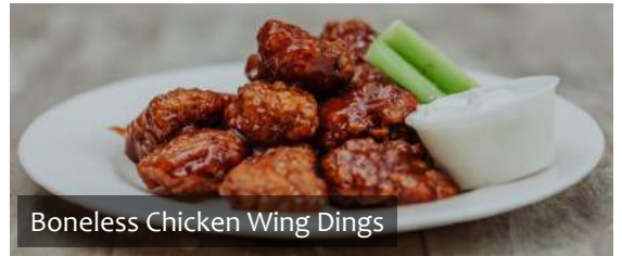
Boneless Chicken Wing Dings

Ham or turkey & assorted spreads wrapped in tortilla shells and cut into pinwheels