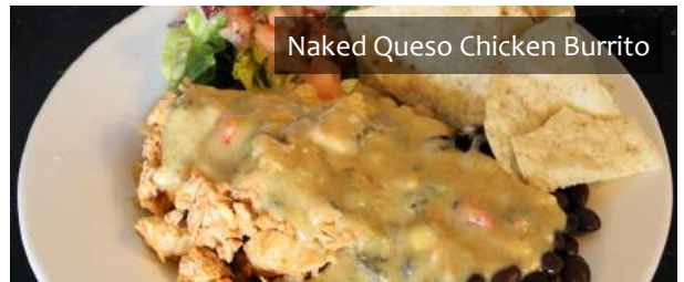
Naked Queso Chicken Burrito

cavatappi noodles, Boursin cheddar cheese sauce or smokey pablano cheese sauce, choice of pulled pork, crispy chicken or diced ham, crumbled bacon, broccoli, scallions, bread crumbs or crispy onion strings, includes garlic breadsticks