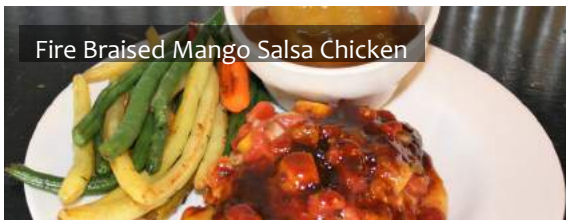
Fire Braised Mango Salsa Chicken