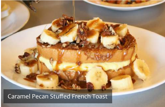
Caramel Pecan Stuffed French Toast