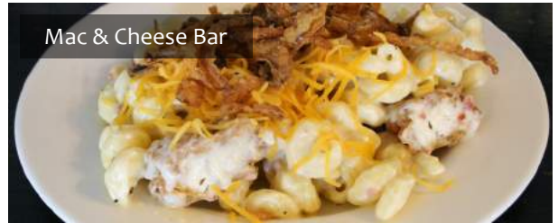
Mac & Cheese Bar