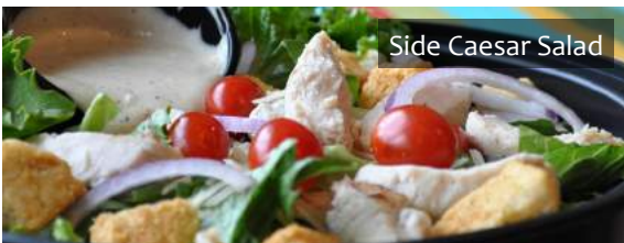
Side Caesar Salad