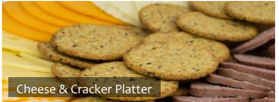
Cheese & Cracker Platter