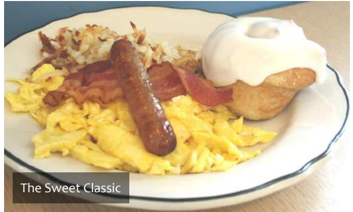
The Sweet Classic