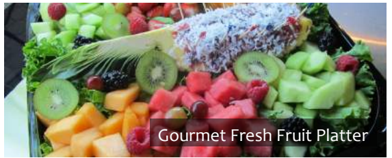
Gourmet Fresh Fruit Platter