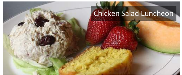
Chicken Salad Luncheon