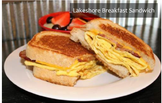
Lakeshore Breakfast Sandwich

Breakfast Bites 4.99 all homemade and fresh baked pigs-in-the-blanket, muffins or mini cinnamon rolls, fresh cut fruit.